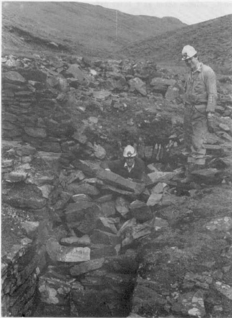
Danebower Colliery, Wildboardclough.