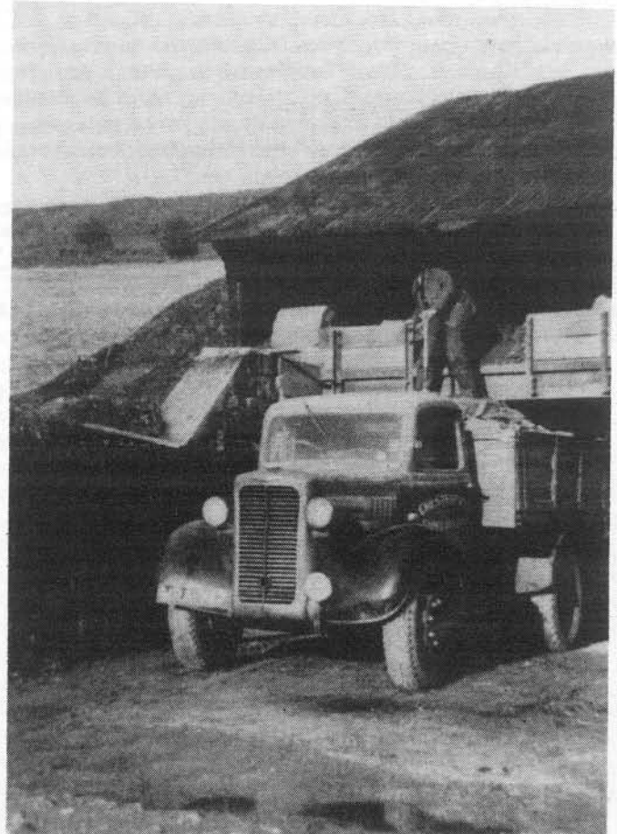
(2) A "headless" miner - probably Dick Bonsall, loading the lorry.

and Baslow. Plans exist for most mines worked after 1877 and, with information gradually coming to light from local people, there is a field for research open.