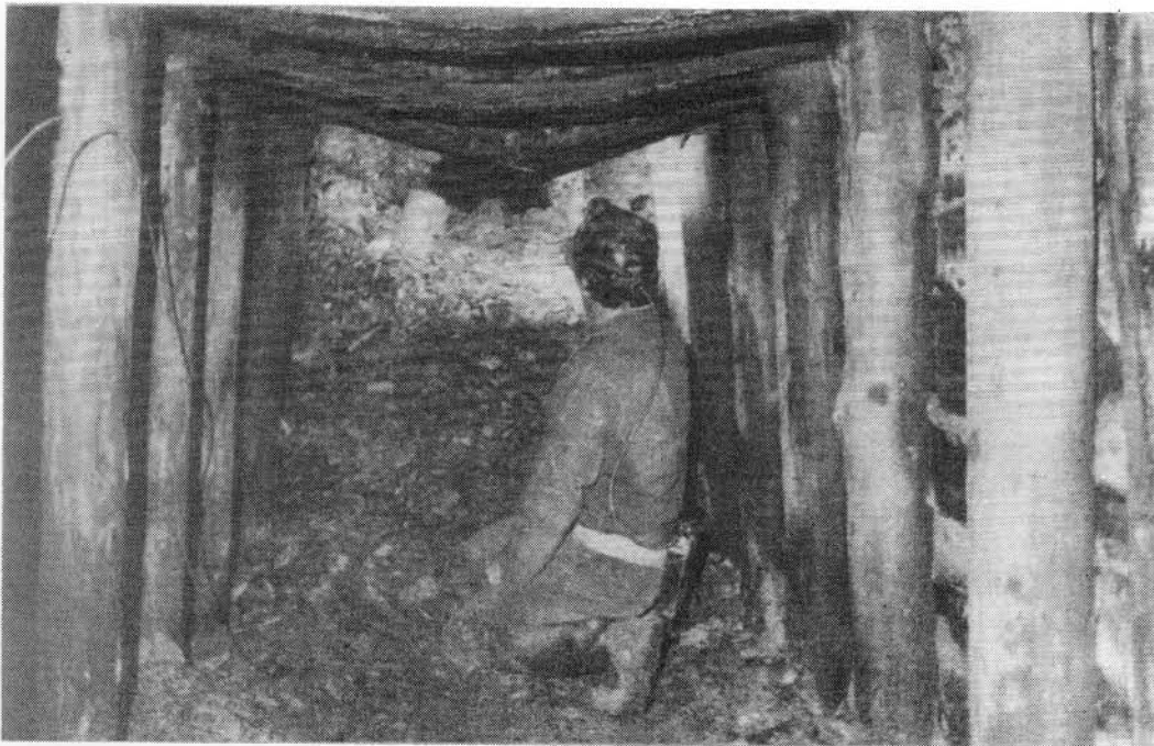
(4) The collapsed roof and timbers near the end of the accessible part of the incline in 1984.