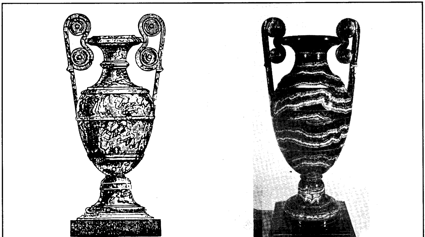
Fig. 3. (a) Vallance's Grecian Vase as shown in the Matlock Tourist of 1843. Said to be 41 inches tall. (b) The Geological Museum vase, said to have been made by Vallance about 1842, and 31 inches high (Geological Museum photo).