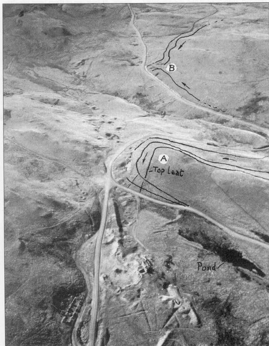
Fig. 1. An aerial view of Esgairhir taken by the Royal Commission on Historical Monuments (Wales), with the six leats inked in. Three skirt the ridge at A, and three converge at trial workings at B. The main lode runs from top to bottom of the picture.

water for such uses was extremely limited, an exception being at Cwmsymlog in the 1620s, where Myddelton had water-operated stamps and pumps. From time immemorial, water had been employed for hushing and ore-dressing, and perhaps for other duties, details of which are now lost.