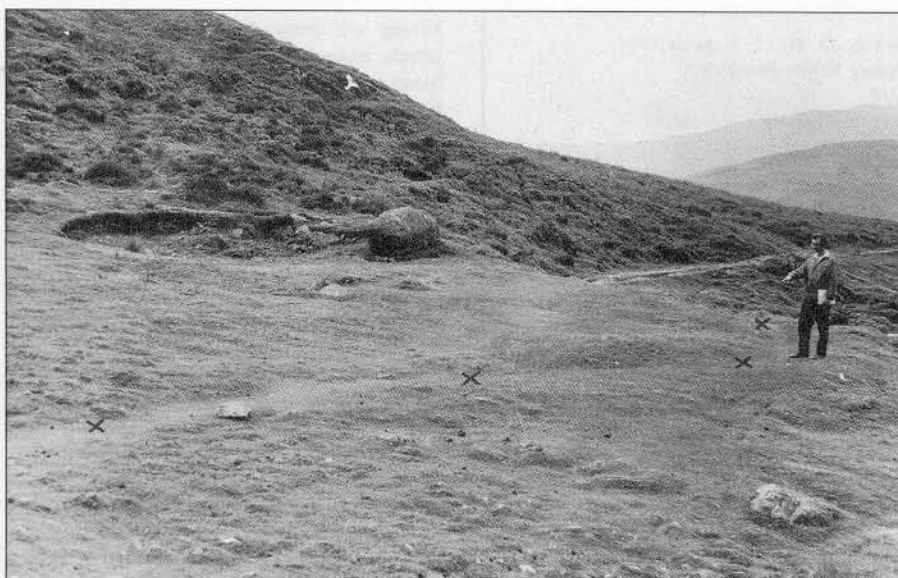
Fig. 2. The northern end of the Precipice Walk, Dolgellau, showing the route of the leat XXXX; the footpath takes a short cut near the boulder.

An invaluable aid to the discovery of leats and ponds, not to mention mining features generally, is aerial photography, as the Royal Commission has illustrated in recent years. However, a word of caution must be uttered. The essential factor is not merely to look, but to know what to look for. In this respect there is always more to learn. Important features can be missed, and blunders have been made by omitting to seek out confirmation on the ground. At Dolaucothi, the Gwenlais leat was missed altogether and a claimed discovery proved to be a footpath (Bick 1988).