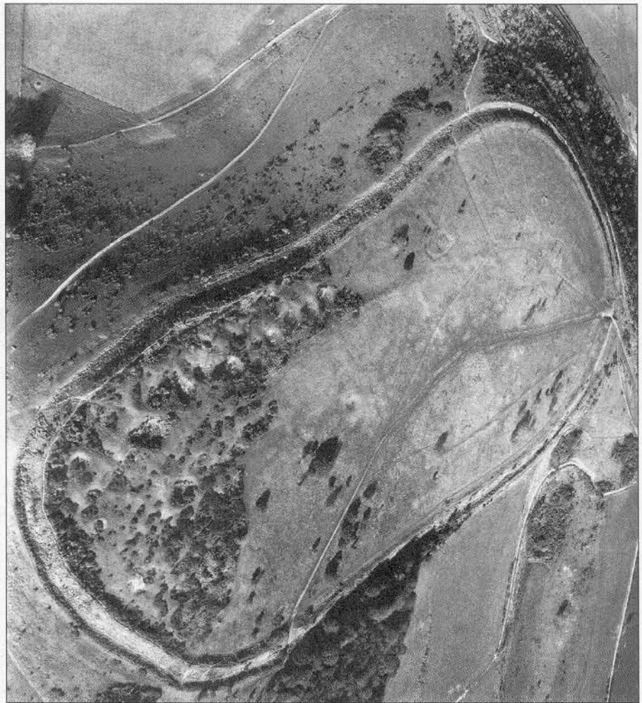
Cissbury Hill, Sussex, with the Neolithic mines in the south-west. A few others can be discerned within the ramparts, and in the east just outside.

The interior of the hillfort has been occupied or utilised from at least the early Iron Age. It was probably at this time that the field system which obscures much of the Neolithic industrial landscape, was created. Shallow hollows, undoubtedly mineshafts reduced by ancient ploughing can be traced over much of the south part of the hillfort. Because of this later agricultural episode, it is difficult to reconstruct the full extent of the mined area, although excavations of a field lynchet in the east part of the hillfort in 1936 recovered flint-knapping debris indicating that activity related to the mines extended over a considerable area. The sub-rectangular enclosure in the north of the hillfort (top right-hand corner of plan) was excavated by Lane-Fox and assigned a Neolithic date on the strength of the flint work recovered from the ditch. The enclosure is certainly earlier than the field system, as a field bank abuts it, but whether it is Neolithic or merely lies over Neolithic deposits is uncertain. Further confusion over the full extent of mining is caused by the numerous Iron