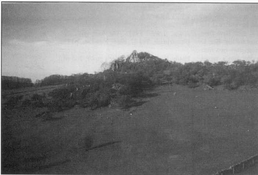
(Below) Rainster Rocks, Brassington, from the south.