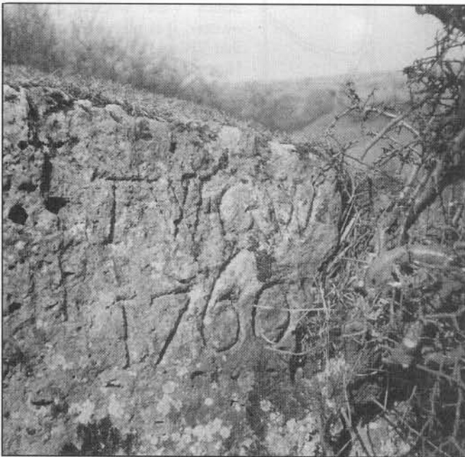
(Above) The inscription.

Among the limestone outcrops and the thousands of fallen rocks and boulders which make up Rainster Rocks, about a mile to the west of Brassington, is one low outcrop which has an eighteenth century inscription carved on it. The inscription could well have been augmented in later years by a line from Robert Burns - "The best laid plans o' Mice an' Men, Gang aft a-gley" - but in fact consists of its original two sets of initials and the date -