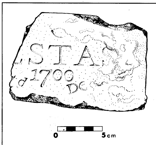
Fig. 3. Firebrick from site of Ailsborough smelting house, SX59196765 (Drawn by John Head).

The most accessible tin smelting house in Devon is that on open moorland at Ailsborough Mine in Sheepstor parish (SX 59196765). It is important as the last operating tin smelting house on moorland Dartmoor and also as likely to have been the site of the last tin blast furnace in operation in Devon. The