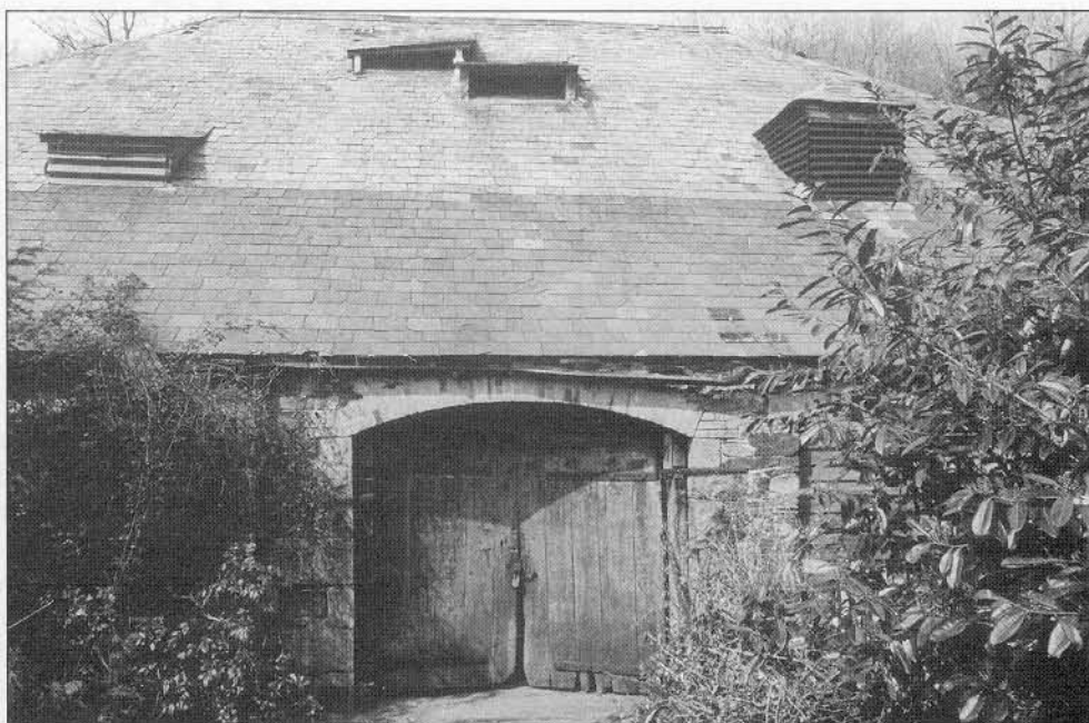
Plate 2. Tin smelting house at Weir Quay, SX 434651, 3.4.1996.