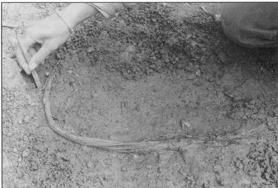
Plate 4 (above). Remains of a twisted-hazel withy used for holding stone tools, Copa Hill.

result of this discovery plans changed, the mine was opened up as a tourist venture and the site was excavated to reveal a large area of opencast trenches situated upon a stockwork of veins carrying malachite and chalcopyrite dissecting the softened dolomitised limestone. Up to twenty radiocarbon dates have been obtained from charcoal and bone tools. Most of these date from the Early-Middle Bronze Age c.1900-1500 BC whilst a few date from the Late Bronze Age and one of Iron Age date. The working implements of the mine consist of many thousands of pieces of utilised and un-utilised bone, mostly of domestic animals, which were used as scraping and prying tools in the soft dolomite, and large numbers of barely-used stone hammers. Hundreds of metres of narrow, irregular mine passages extend to a depth of some 30 metres beneath ground level although many of these were cut and cleared-out by later 19 th century miners.