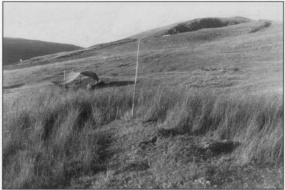
Plate 1 (above). View north towards summit of Copa Hill with gash of pre-historic opencast with spoil-heap extending downslope to the west.