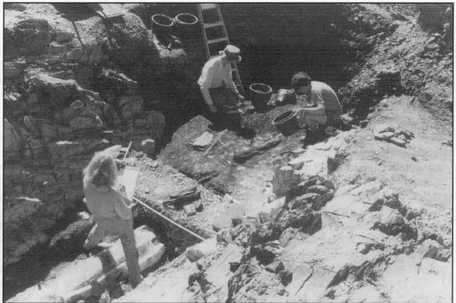
Plate 3 (bottom). Part of the 5m long hollowed-out alder log used as a launder some 4000 years ago. Note the large cobbles used as mining hammers piled on the right.