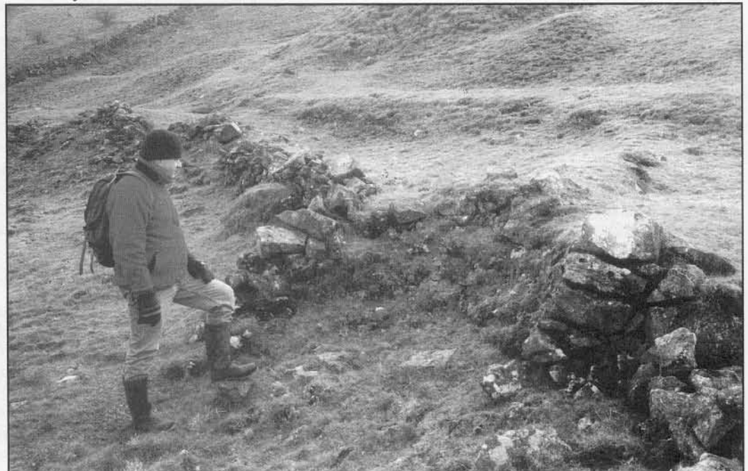
Fig. 2. The bouse team with barrow-run above at one of the belland yards on Lees Rake/Burfoot Old Vein at the Burfoot Mines.

A small ruined hillock-top belland yard. There are two short stretches of curved wall bases surviving, and a bank across the