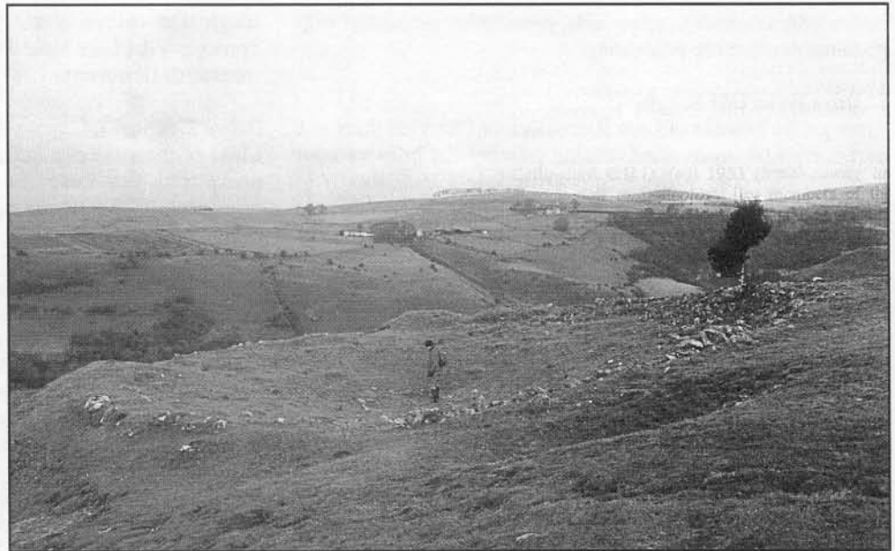
Fig. 1. The walled ore-washing pond adjacent to Lees Rake at the Burfoot Mines.

a dressing feature, with a deep central circular pond, now dry, surrounded by more gentle sloping sides to the enclosing wall. It has clearly been used for washing and possibly buddling ore, as the gently sloping sides surrounding the pond hollow comprise clay and other fine material dumped as a result of these processes; the floor surrounding the pond was presumably originally flat. The pond appears to be shown on a late 18 th century mine map (Cook n.d.) and is depicted on the tithe map of 1848 (Gratton 1848). To the west, on the other side of the field wall there is a short sinuous stretch of a possible leat leading towards the pond.